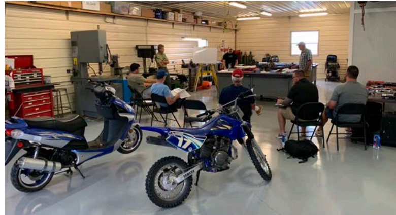
Mechanical trainer training with the church from Georgia.

Opportunities are always around us. Lord-willing, we have been faithful with this season that God has sovereignly brought upon us. Similar to the "Parable of the Talents" in Matthew 25, we don't want to have "buried" 2020 in the ground. Our Master expects that we are faithful stewards of what He has entrusted to us.