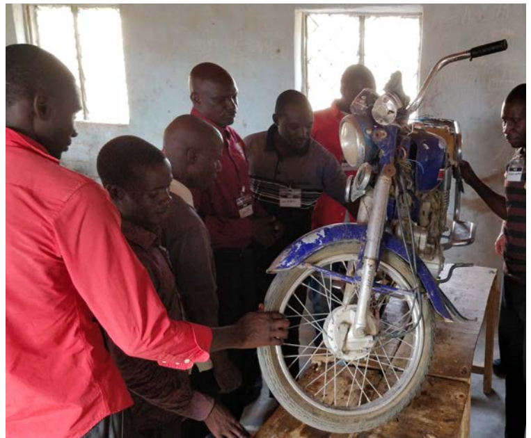
Students inspect a motorcycle in Western Africa this year.

One of the ways we want to bring you into these stories is through a new podcast that we are launching in January. We will be hosting people from multiple organizations, working all around the world, sharing how they have been trained or train Christ-followers with tools to show the love of Christ. We desire to see this vision become a movement of God's people, for His glory!